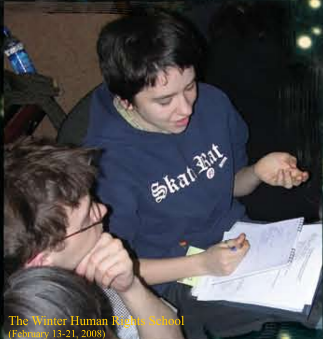
The Winter Human Rights School (February 13-21, 2008)