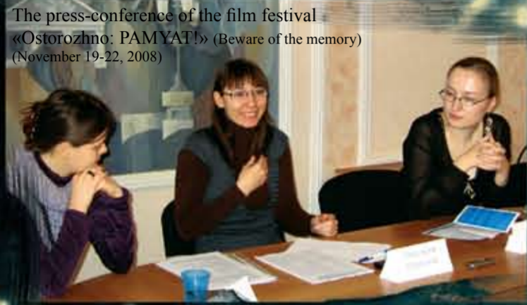
The press-conference of the film festival «Ostorozhno: PAMYAT!» (Beware of the memory) (November 19-22, 2008)