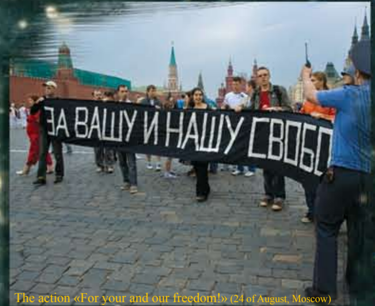
The action «For your and our freedom» (24 of August, Moscow)